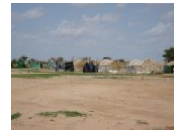
"Refugee camp in Gaga, Chad" © 2009 S. Patrick Murphy

© Image description & photo credits in each photo file name | High-res. download link: SPMurphy_Images.zip