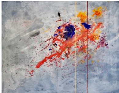
"No Title", 2013 Acrylic on canvas, 80 x 100 cm