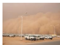
"Haboob in Khartoum, Sudan"