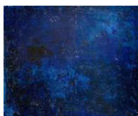
"The Home of the Free Man" , 2004 Acrylic on canvas, 100 x 120 cm

Selection of 4 works presented at the exhibition | 2 photos taken during deployment by S. Patrick Murphy