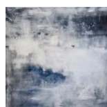
"C 3 H 8 NO 5 P" , 2017 Acrylic, ink and felt- tip pen on canvas, 100 x 100 cm