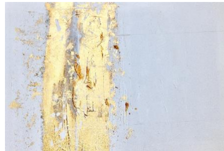
"No Title", 2017 Acrylic and metal leaf on canvas, 70 x 100 cm